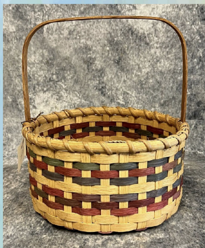
8" Easter Basket - $45.00

Make it a Lazy Susan for an additional $10.00