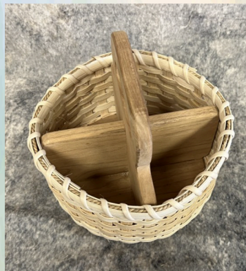
8" Utensil Basket - $40.00