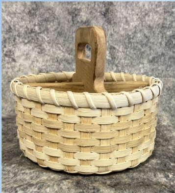
6" Utensil Basket - $30.00

Deadline to register for January Class is March 3, 2025