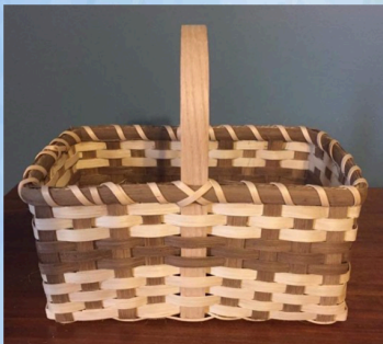
6" x 10" Market Basket - $30.00

Deadline to register for January Class is January 15th