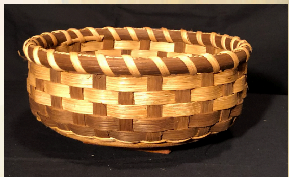
8" Lazy Susan Basket - $45.00