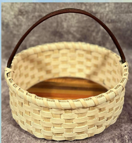
10" Multi Wood Pie Basket - $50.00