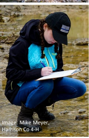
4H is a community of young people who are learning leadership citizenship and life skills.